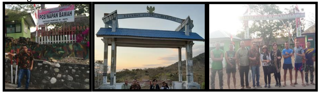
Figure 5. Discussion at the Napan Border, Timor Tengah Utara Regency NTT Indonesia with Oecusse (Democratic Republic of Timor Leste)

Development of the Border Situation (crisisgroup.org, 2010)