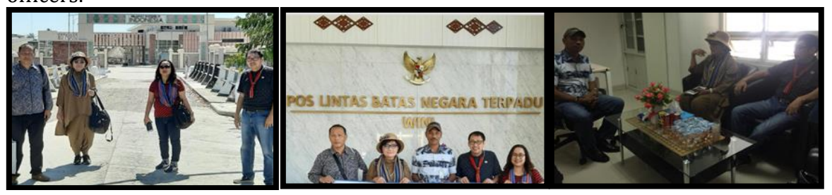
Figure 6. Discussion at the Wini Border, Timor Tengah Utara Regency NTT Indonesia with Oecusse (Democratic Republic of Timor Leste)