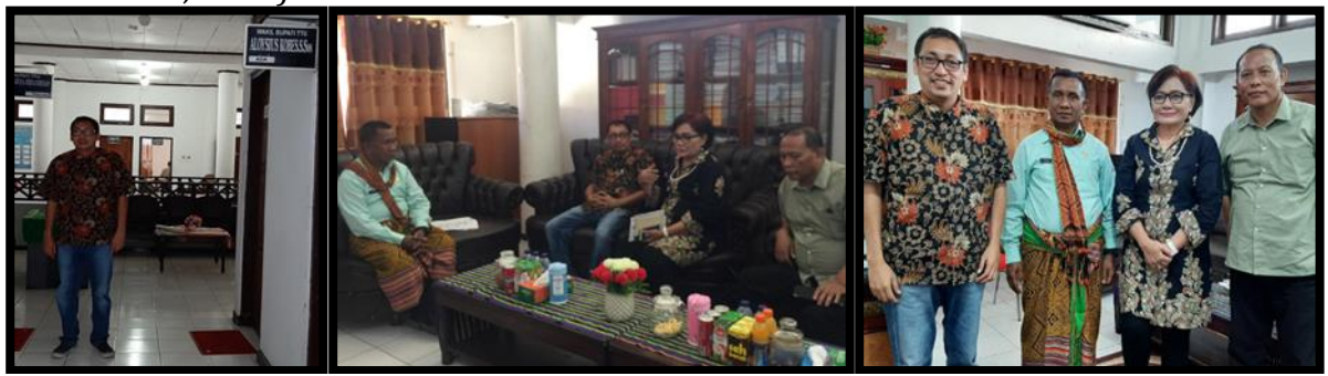
Figure 3. Discussion with the Regional Government of Timor Tengah Utara (TTU NTT)

Indonesians give explanations, and East Timorese sometimes contradict each other. "There are still groups of people who have different views. They have traditionally had "borders" recognized for generations by the tribes residing in the two countries, different from those contained in the two legal bases mentioned above. On the other hand, no evidence was found to support the community's "claim," so the negotiators could not bring this "claim" to the meetings of the two countries. This problem is felt in the western sector, especially in the Manusasi area. The handling of the RI-Timor Leste national borders has been handled by 2 (two) institutions. Namely the RI-RDTL Joint Border Committee (JBC), which the Ministry of Home Affairs coordinates, and the RI-RDTL Border Demarcation and Regulation Technical Sub-Commission, which is coordinated by the Ministry of Defense and Bakosurtanal." (DsfIndonesia, 2011)