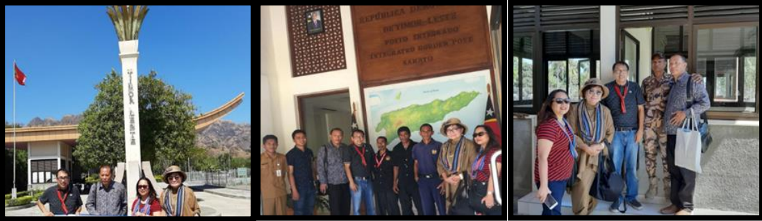
Figure 4. Discussion at the Oecusse Border, Democratic Republic of Timor Leste (RDTL) Indonesia-Timor Leste Border Conflict (Nino, 2018)

In another example of conflict in 2016, Indonesia and RDTL have not yet agreed on a border area in the Noelbesi-Citrana area, North Netamnanu Village, East Amfoang District, Kupang Regency. The state boundary line to the west of the small river and the land status is still a sterile area that the two countries cannot manage. Facts on the ground, Timor Leste has permanently built agricultural offices, meeting halls, dolog warehouses, rice mills, construction of irrigation canals, and paved roads. Fifty-three families live in the sterile area in Naktuka Hamlet, North Netamnanu Village, East Amfoang District. They have Timor Leste ID cards. The presence of 53 heads of families from Timor Leste sparked residents' anger. The citizen of the former Portuguese colony built on the border area, which is still disputed by the two countries, so it is strictly forbidden to occupy or build public facilities from certain parties. According to the 2003 agreement, the area is included in the free zone. Because it is still being disputed between Indonesia and Timor Leste. (Andalan, 2016).