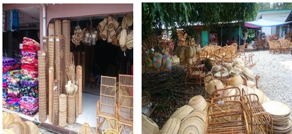
Image 2. Sarikin Market

The trade sector is the most cultivated sector in Jagoi Babang District. Based on data from the Cooperative Office, UMKM, Bengkayang Regency Industry, the number of cooperatives both KUD / Non KUD in Jagoi Babang District is 10 (Ten) units where Jagoi Village has 5 (five) Cooperative units while the village that does not yet have Cooperative is Sinar Baru village and Grit Village. The most numerous trading sector is the type of retail traders, especially groceries trading. The existence of market facilities is very much needed because it considers the location of Jagoi Babang Sub-District right on the border crossing with Malaysia.