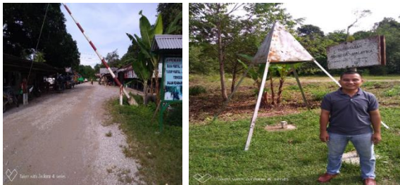
Image 1. Border conditions Jagoi babang

districts, were found to be able to encourage the growth of domestic production. Agricultural products such as cocoa, rubber, small industries (home industries such as splints, handicraft woven chairs), medicines, clothing, food, beverages and accessories are traded to Kuching